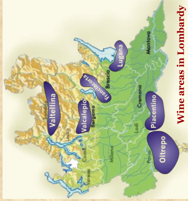
Wine areas in Lombardy

If you like good food, enjoy good wine, are fond of good Italian life style, then do not look elsewhere !